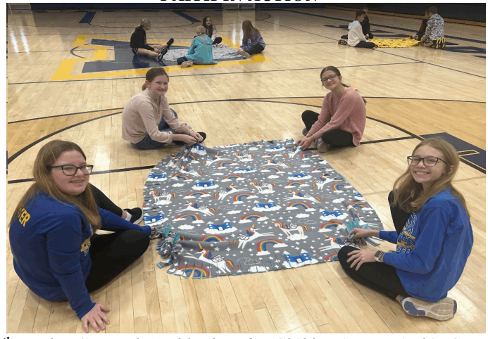
6th grade PSR made 16 blankets for Children's Hospital in STL.